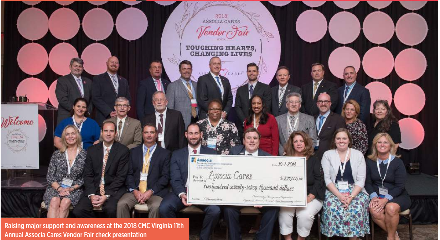
Raising major support and awareness at the 2018 CMC Virginia 11th Annual Associa Cares Vendor Fair check presentation