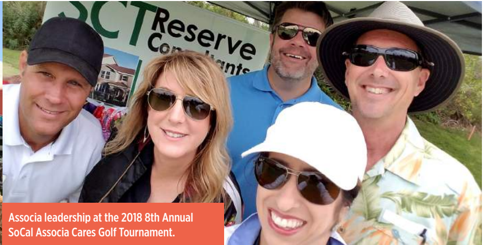
Associa leadership at the 2018 8th Annual SoCal Associa Cares Golf Tournament.