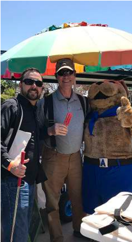
Associa Supports Kids' (ASK) Scout makes an appearance at the 2018 5th Annual Homeside Properties, Inc. Associa Cares Mini-golf Event