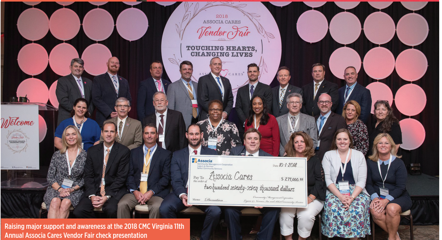
Raising major support and awareness at the 2018 CMC Virginia 11th Annual Associa Cares Vendor Fair check presentation