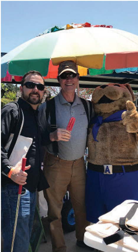
Associa Supports Kids' (ASK) Scout makes an appearance at the 2018 5th Annual Homeside Properties, Inc. Associa Cares Mini-golf Event