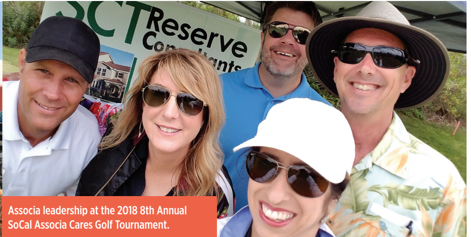
Associa leadership at the 2018 8th Annual SoCal Associa Cares Golf Tournament.