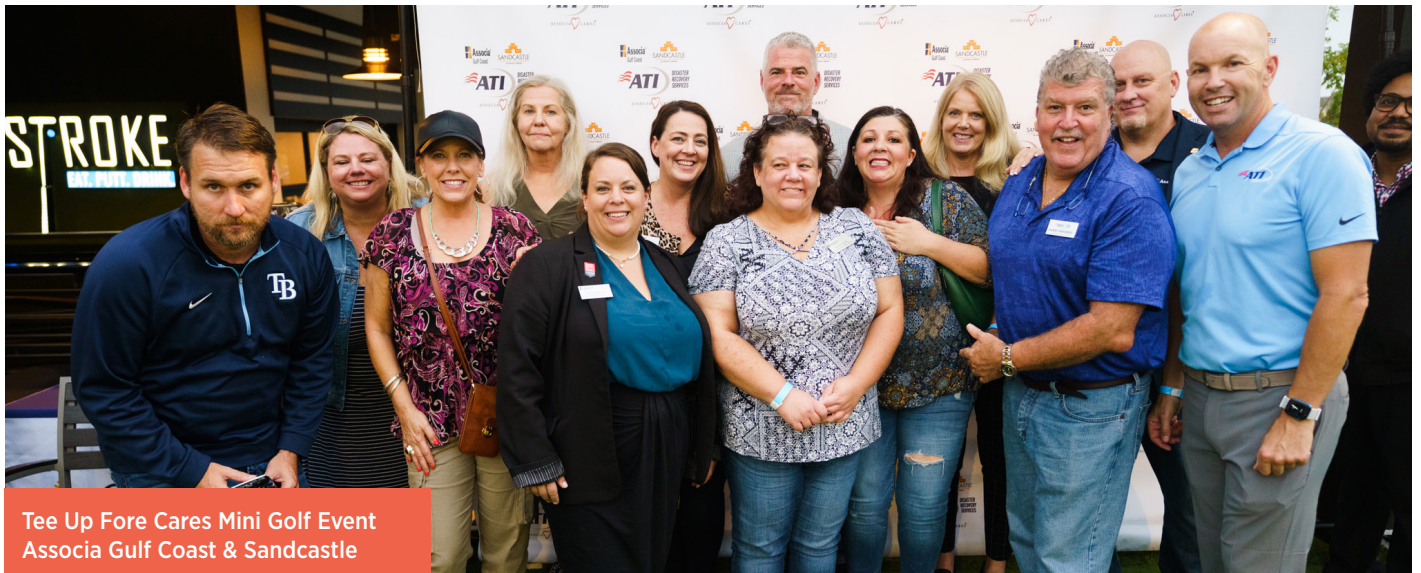
Tee Up Fore Cares Mini Golf Event Associa Gulf Coast & Sandcastle